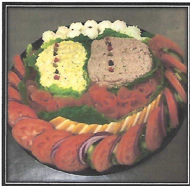
Diamond Simcha Platter